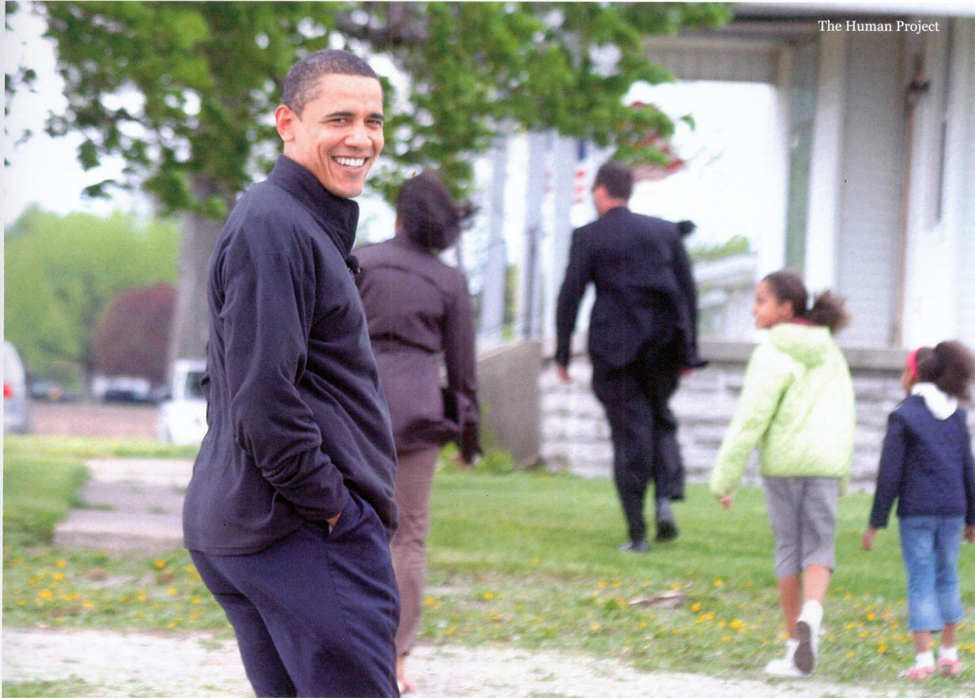
Senator Barack Obama and family visit the Obama ancestral home in Tipton County, Indiana in May of 2008.