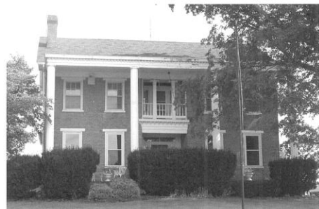
15074 This I-house bears a Neoclassical, two-story front portico with a dentiled cornice and classical columns.