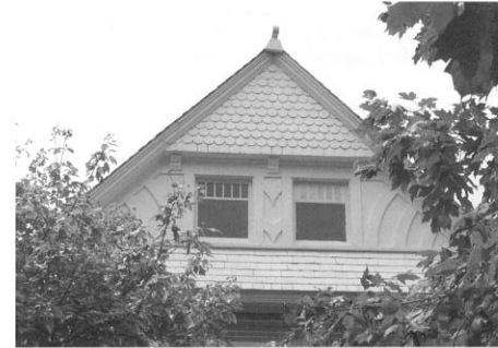
15076 The Smith House, Queen Anne in style, displays an ornately clad front gable with fishscale shingles, stick work, and decorative brackets.